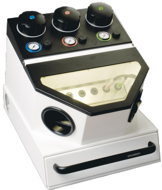
Cemat- NT 3