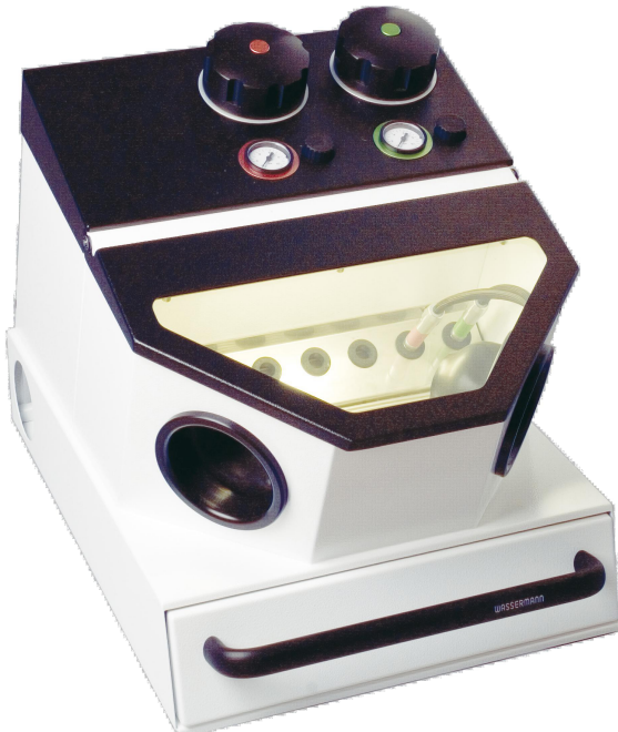
Cemat- NT 2