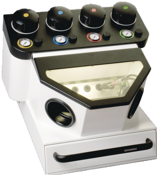
Cemat- NT 4