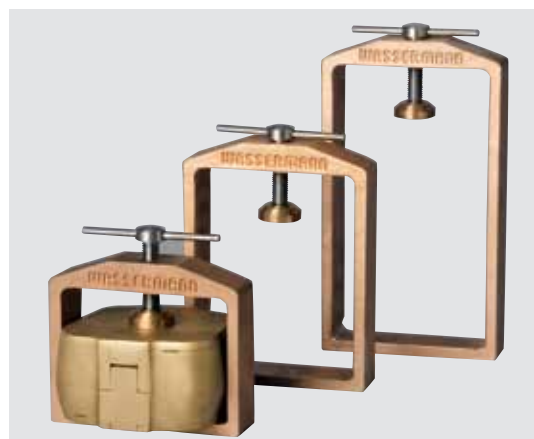
Universal flask bracket