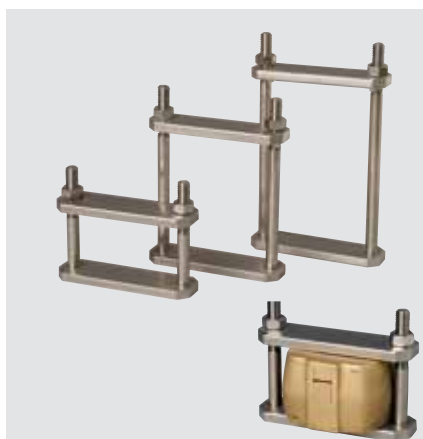
Special steel tension bracket