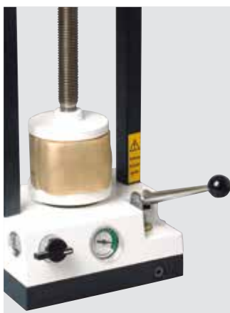
WW-33 1-3 flasks