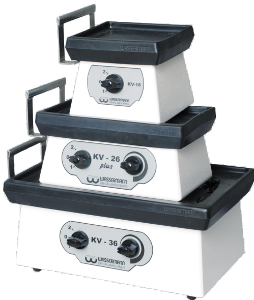
KV-16, KV-26 plus, KV-36 stainless steel version plastic-powder coated (natural white close to RAL 9016)