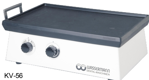
KV-56 cast housing plastic-powder coated (natural white close to RAL 9016)