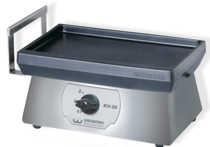
KV-26 stainless steel version matt